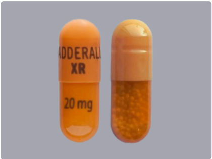
Adderall XR 20mg