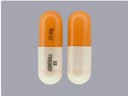
Adderall XR 25mg