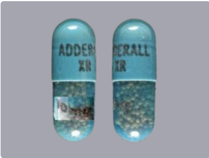
Adderall XR 10mg