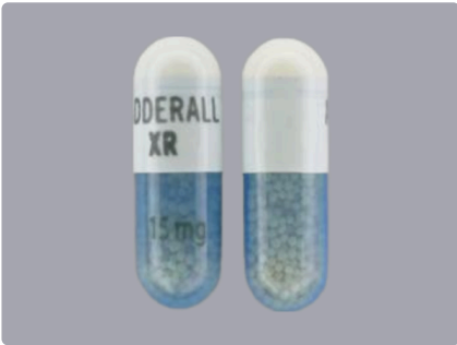
Adderall XR 15mg