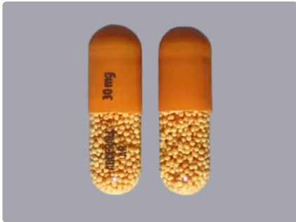
Adderall XR 30mg