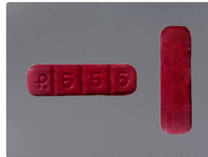
Red Xanax Bar