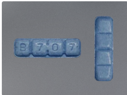
Blue Xanax bars